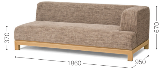
② Japanese Oak NF Bentley BR/F5