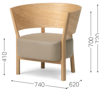
⑥ Japanese Oak NF KP-LGY/L3