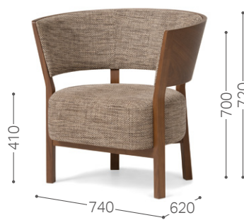
⑦ Walnut CW Bentley BR/F5