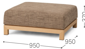
④ Japanese Oak NF Bentley BR/F5