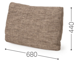
⑤ Bentley BR/F5