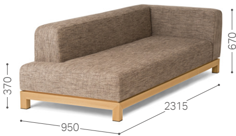
③ Japanese Oak NF Bentley BR/F5