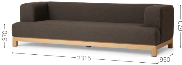
① Japanese Oak NF Tonica DGY/F4