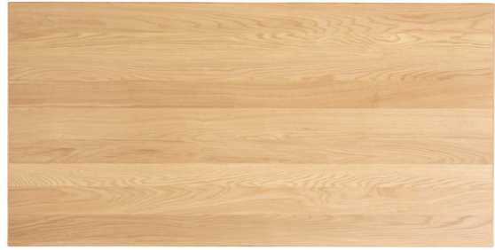
Top board: random-match