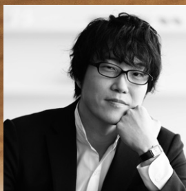
nendo Oki Sato

An additional model to Splinter collection designed by Oki Sato from nendo. The chair shell is upholstered with special thick leather supplied by a sole Japanese saddle maker, SOMÈS SADDLE. The high grade leather makes its back view more beautiful.