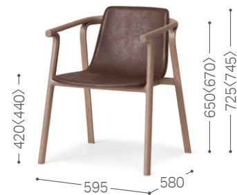
Japanese Oak GY SO-DGY

Special leather wax is included for the following items. Leather is kept in good condition by regular maintenance, once or twice a year according to conditions. (Splinter Lux Dining Armchair / Tack Lux Living Easy Chair, Ottoman) This special leather wax was developed exclusive for SOMÈS SADDLE thick leather. Please don't use for other leather products.