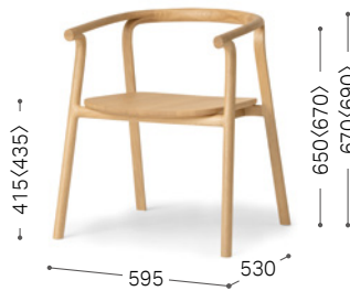
② Japanese Oak NF