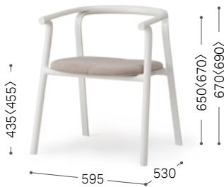
① Japanese Oak NWT Ultrasuede LGY/F3