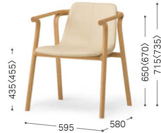
③ Japanese Oak NF RK-NL/L2