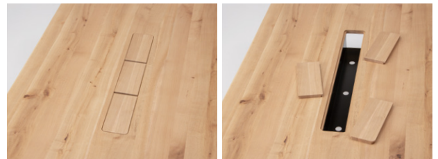
Three-piece type for the top board of 2000–2400

*Accessory: height adjusters, reinforcement back beam (for ones wider than 1700 mm)