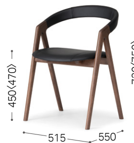
Japanese Birch MBR MG-BL/L3

Chair (Upholstered Seat) Chair H (Upholstered Seat)