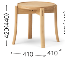
⑤ Japanese Ash WNF