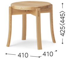
⑥ Japanese Ash NF