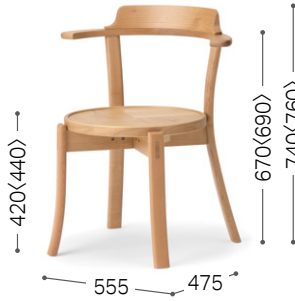
② Japanese Cherry NF