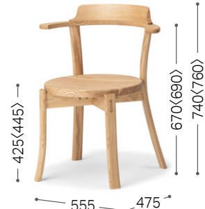
③ Japanese Ash OFN