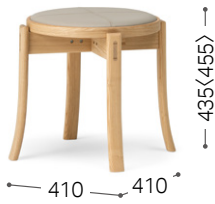
④ Japanese Ash NF MG-LGY/L3