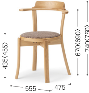
① Japanese Elm NF Kokyu RBR/F5