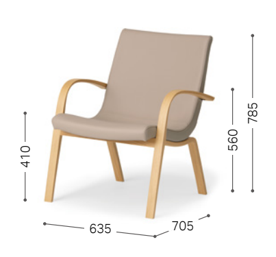
② Japanese Oak NF MG-LGY/L3