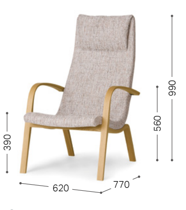
① Japanese Oak NF Linova OR/F3