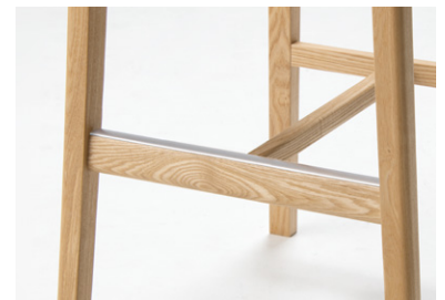
② Optional Footstep