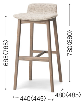
① Japanese Ash GY Jan GY / F2