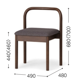
② Japanese Oak DBR LikeDGY/F3