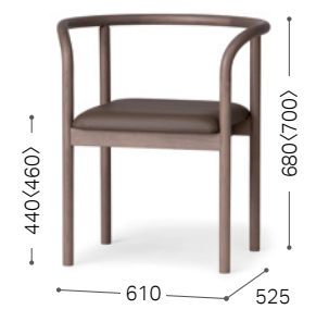
① Japanese Oak GY MG-KGY/L3