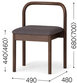
② Japanese Oak DBR Like DGY/F3