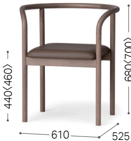
① Japanese Oak GY MG-KGY/L3