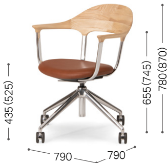
① Japanese Ash WNF BQ-BR/L3 Frame: C-SL