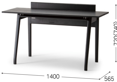
④ Japanese Ash BL