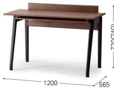
⑤ Japanese Ash MBR