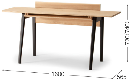
③ Japanese Ash WNF

A space for work becomes required at home, an environment where food, clothing, and shelter were the mainstay. Accordingly, some issues to solve came up such as "functional requirements for size and storage capacity," "discomfort in coexisting with a relaxing space," and "noise generated by the presence of work in the home." The goal was to create a desk that would be functional for organizing documents and gadgets, yet harmonize with the other furniture in the living room and dining room, and look beautiful with the FOUR chair. The design feature is the fusion of the floating top panel, the straight lines of the back panel, and the organic curves of the legs. The FOUR desk, with its warm, natural materials, is a piece of furniture you will want to spend a lot of time with.