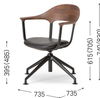
② Japanese Ash MBR BQ-BL/L3 Frame: S-BL