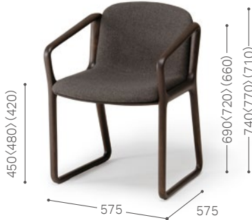
① Japanese Oak DGY Tonica DGY/F4 (Outside: BQ-BL/L3)