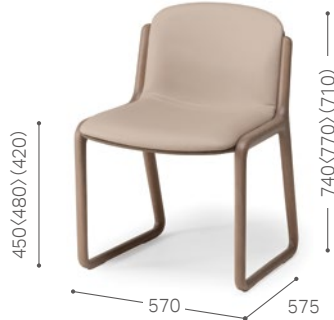
② Japanese Oak GY MG-LGY/L3 (Outside: MG-KGY/L3)