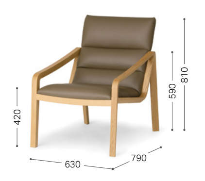
① Japanese Oak NF MG-KGY/L3