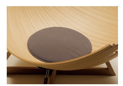
② Ultrasuede GY/F3